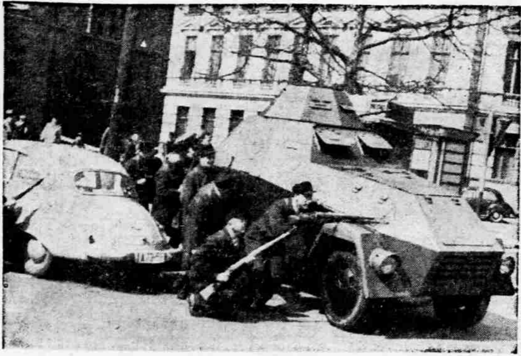
'REVOLUTION CRUSHERS'—Armed workers from the Communist Militia crouch behind armored car and fire blank cartridges during demonstration in East Berlin, staged by the Reds to show their design for quelling "Hungarian-type uprisings." They went thorough war-like maneuvers in the theory they were trying to overcome "an armed counter-revolutionary group that had undertaken a provocation."