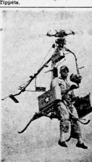
SMALLEST, lightest helicopter is shown at Glendale, Cal. It is one-man, rocket power.

Corvallis—(U.P.)—Portland's golf team defeated Oregon State 10-8 Tuesday.