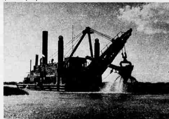
This giant dipper dredge scoops 15 tons at a time in digging a 27-foot channel through Lake St. Francis.