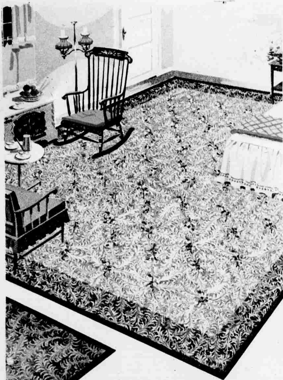
Above: ROSEWILD, Style No. 4871, in silver taupe with soft pink roses and yellow accents. Left: ROSEWILD, Style No. 4870, in light brown with yellow roses. Both styles available in these sizes: 12' x 15', 12' x 12', 9' x 15', 9' x 12', 9' x 10½', 7½' x 9', and 6' x 9'.