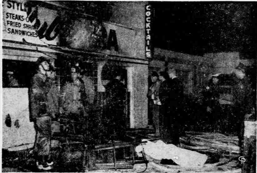
EMPTYING PAIL OF GASOLINE in crowded cocktail bar, four men, angered because they were refused service, caused deaths of six, injuries to three persons in resulting explosion and fire. Body of one victim is covered with sheet in foreground.

Salem—(U.P.)—The House has defeated 43-15 House bill 641 that would have allowed taverns to sell wine by the glass.