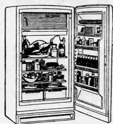
LB 12 P

At 25% Off the Regular Price—Several Models to choose from—Originally Priced from $3.95 to $14.95. Offer Limited to Present Stock.