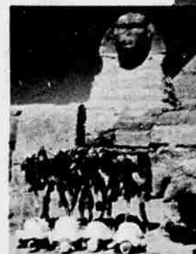
EGYPT — Arabs in prayer turning toward Mecca before the Great Sphinx, which guards the entrance to the Nile Valley.

To acquaint yourself with this new project, accept the offer described above. There is no obligation—this is merely a "demonstration" offer. If, however, you are delighted with your trial package and do wish to continue on your "trip around the world," you pay only $1 for each monthly "tour" thereafter. And you may cancel at any time. Mail the coupon now!—AMERICAN GEOGRAPHICAL SOCIETY'S Around The World Program, Dept. FW-5, Garden City, N. Y.