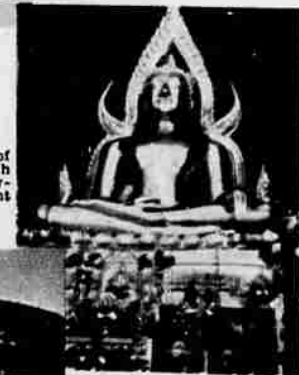
SIAM — Famous image of Buddha, festooned with golden ornaments and jewels, stands in magnificent temple at Bangkok.