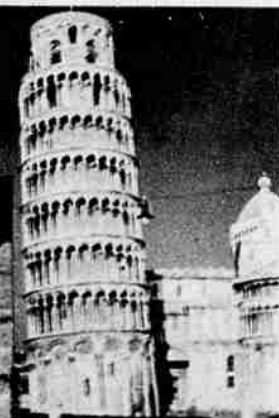
(above) ITALY—home of the famous, much-visited Leaning Tower of Pisa, where the astronomer Galileo is said to have tested the speed of falling objects.