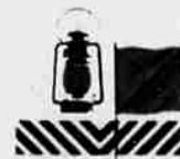
RECONDITIONED FOR SAFETY

We've trained experts and modern facilities to do this job properly.