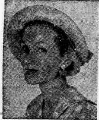
Silky straw rolls gently back off the face in a Damozel original that recalls the hats of the early Thirties. It has a rounded, head-hugging crown.