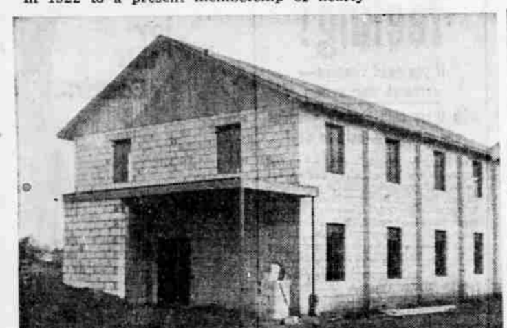
NEW CHURCH BUILDING —Mt. Pitt Avenue Church of the Nazarene will hold services Sunday for the first time in their new building at Mt. Pitt ave. and Chestnut. This church was sponsored by the First Church of the Nazarene congregation.