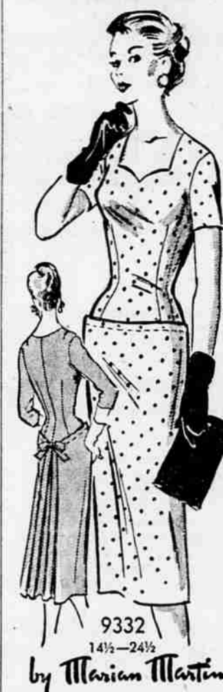
9332 14 1/2 - 24 1/2 by Marian Martin

PRINTED Pattern for Half-Sizers—this lovely dress assures easy, accurate sewing! Smooth front silhouette; new back interest displayed by soft folds from hip to hemline, a graceful bow. Flattering in any way you view it!