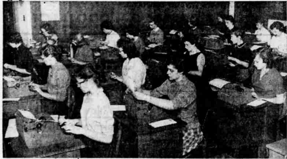
TYPE LETTERS —The advanced typing class at Medford High school is shown above typing letters which are being sent out to residents to remind them of the Southern Oregon Child