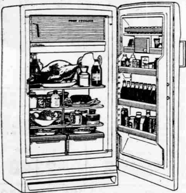
1957 MODEL LB-12P

With Famous G.E. REVOLVING SHELVES SATURDAY SPECIAL $269 95 $12.00 A Month SAVE $20 00