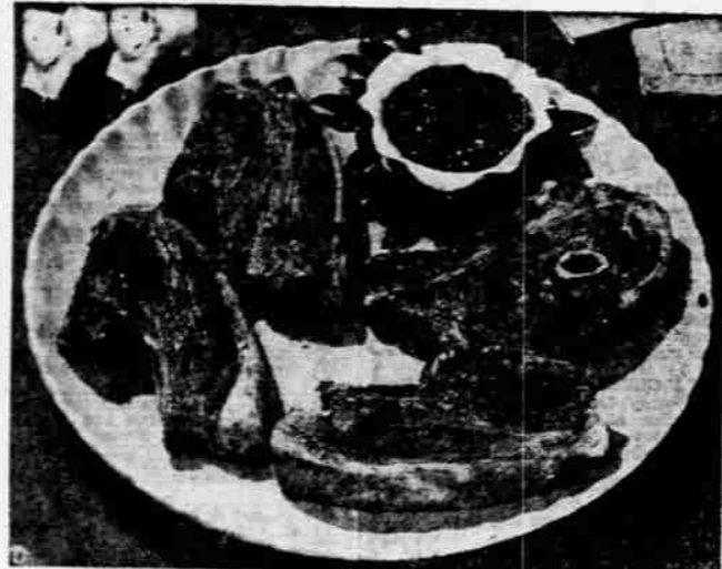
LAMB FOR SPRING —Spring is here and with it lots of luscious lamb. Whether you serve an elegant leg of lamb or less expensive but equally elegant tasting shoulder chops—mint, currant or grape jelly is a sure-fire accompaniment.

Brown onion and garlic in melted butter. Add to meat and combine with bread crumbs, parsley, cheese, salt, pepper, oregano and eggs. Mix well. Shape into balls allowing one-fourth mixture per ball. Brown a few at a time in a few tablespoons hot fat over low heat. Drain off