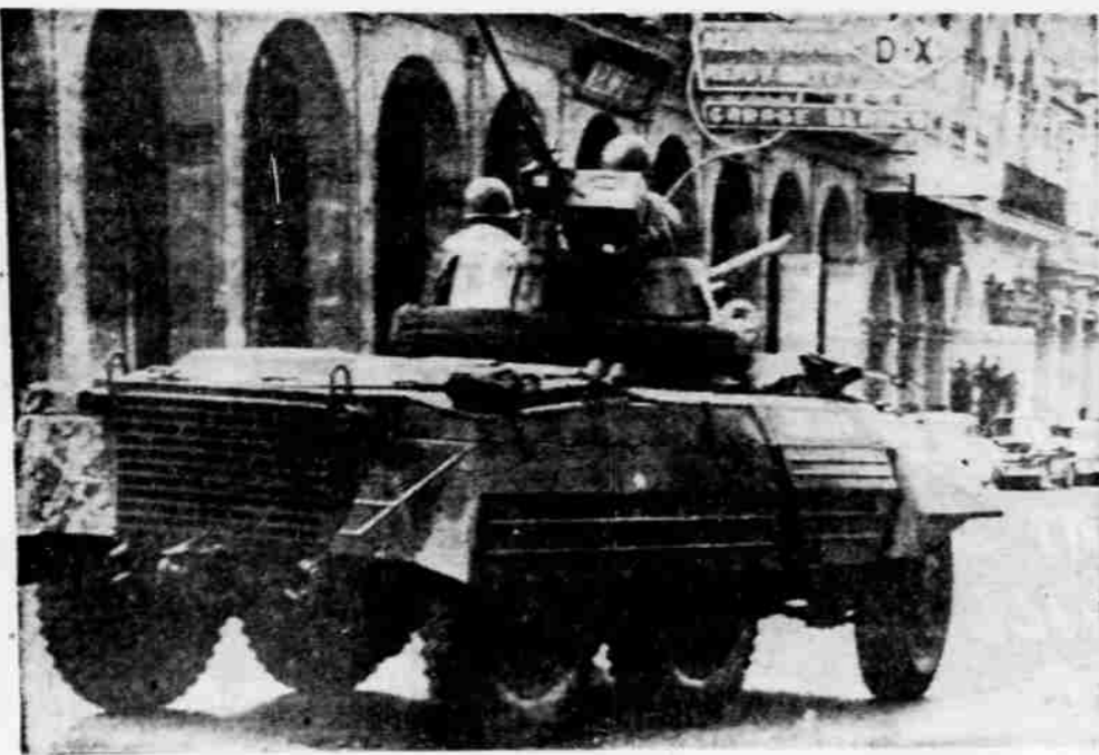
KEEPING THE PEACE —An army tank moves down an Havana street after an outbreak of violence in which rebels attacked the presidential palace in Havana. The Cuban Army said the attempted assassination of President Fulgencio Batista ended in bloodshed, death and failure for the handful of student revolutionaries who staged it. At least 36 persons, including a U. S. citizen were killed and more than a score wounded.