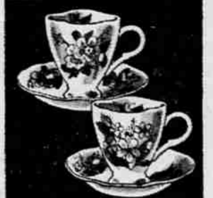
Reg. 1.95—BONE CHINA CUPS AND SAUCERS

Your Choice. Colorful designs with ornate gold trimmings. 99¢ NO MONEY DOWN Add to Your Account