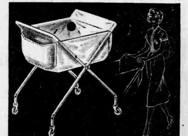
Reg. 4.95—ROOMY CANVAS AND ALUMINUM LAUNDRY CART

Scoops any soft foods, releases automatically. 99¢ NO MONEY DOWN Add to Your Account