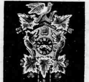
Reg. 24.95—IMPORTED CUCKOO CLOCK

Your Choice. Colorful designs with ornate gold trimmings. 99¢ NO MONEY DOWN Add to Your Account