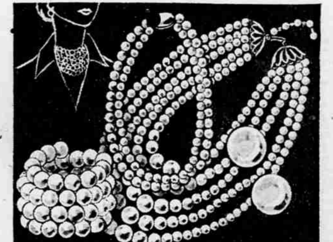
Reg. 2.95—ASSORTMENT OF SIMULATED PEARL "FILL-INS"

Hand-painted ceramic set with wood handles and rack. 1 99 NO MONEY DOWN ONLY 25¢ A WEEK