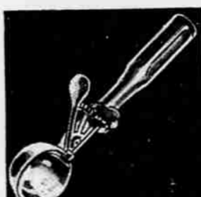
Reg. 1.95—Stainless Deluxe Ice Cream Scoop

Handy 2-Quart casserole, hand-painted ceramic lid. 1 99 NO MONEY DOWN ONLY 25¢ A WEEK