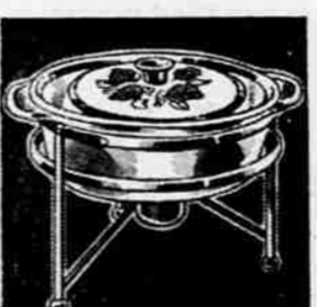
Reg. 4.95—Copper and Brass CASSEROLE WARMER

Latest trend in pearl jewelry. Necklace designed to come down low on that neckline and resemble bib. Matching bracelet, earrings. 1 95 NO MONEY DOWN... 25¢ A WEEK