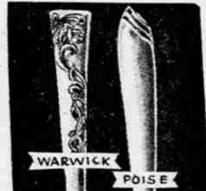
Reg. 29.95—STAINLESS 52-PIECE TABLEWARE

German hand-carved in dark mahogany color. 14 88 NO MONEY DOWN ONLY 50¢ A WEEK