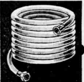
Reg. 1.95—Vinyl Plastic 50-FT. GARDEN HOSE

Will not rust, stain, corrode. Two patterns. 14 88 NO MONEY DOWN ONLY 50¢ A WEEK