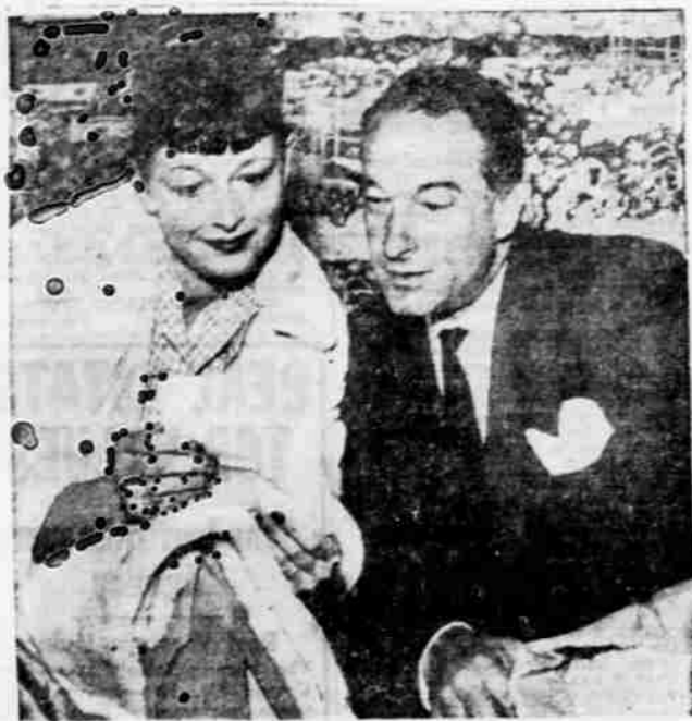
US ON A BUS —Victor Borge, famed pianist-humorist, and his wife check their schedule in Salt Lake City. They are aboard their special Greyhound bus which is fitted out with beds and drapery partitions. They made an all night run from Salt Lake City to Portland to be on time for his next show.