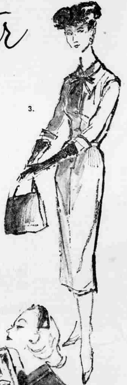
3—Another orlon and wool beauty with an expensive sun burst detail at the waist and it's own grey and white striped scarf. Sizes 10-18. 25.00