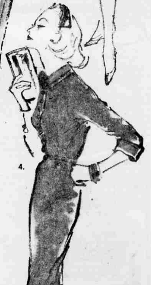
4—Touch of genius — a detachable darker grey collar of fine linen over the easy care orlon and wool sheath, patent belt. Sizes 10-18. 25.00