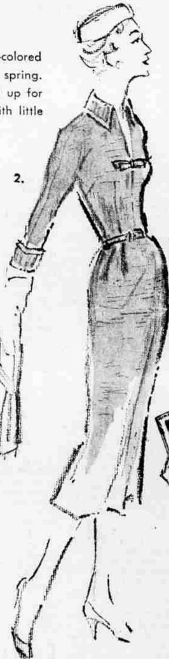
2—Surprise! When you see the back of this orlon-wool sheath — buttons from neck to hem, and has exciting blouson look. Sizes 10-18. 25.00