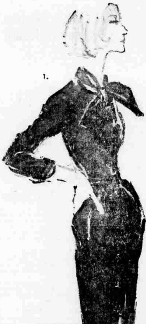
1—Grey silk-like cotton-rayon entrest, contoured self-belt. Sizes 10-18. 19.95

Here, dresses by R & K — for ladies who like pale, neutral-colored clothes—of which we have an abundance to choose from this spring. All four of these dresses can go to the office, can be dressed up for semi-occasions . . . and are within the budget of the girl with little money and big fashion sense.