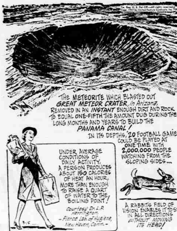
THE METEORITE WHICH BLASTED OUT GREAT METEOR CRATER, IN ARIZONA, REMOVED IN AN INSTANT ENOUGH DIRT AND ROCK TO EQUAL ONE-FIFTH THE AMOUNT DUG DURING THE LONG MONTHS AND YEARS TO BUILD THE PANAMA CANAL!

UNDER AVERAGE CONDITIONS OF DAILY ACTIVITY, A PERSON PRODUCES ABOUT 150 CALORIES OF HEAT AN HOUR. MORE THAN ENOUGH TO RAISE A QUART OF WATER TO THE BOILING POINT!