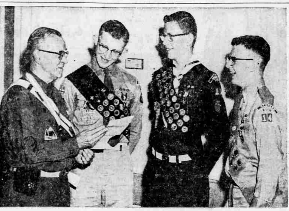
RECEIVE EAGLE AWARDS—At a ceremony Monday night at St. Mary's academy three Crater Lake Area Scouts received Eagle Awards. The awards are made to Boy Scouts who have earned 21 merit badges and have proved to be outstanding leaders in the church, schools and community as well as the scouting program.