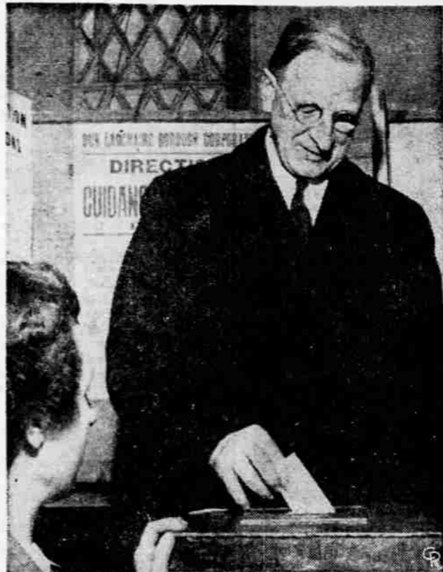
WINNING 78 SEATS in 147-seat Eire parliament, Fianna Fail party of Eamonn De Valera, 74, regains control, assuring "Dev" of election as prime minister when new parliament convenes March 20. He is casting ballot in Dublin during election.

The theater management said, however, that "Baby Doll's" original booking for several weeks has been cut to one week, and that the film would be shown to adults only.