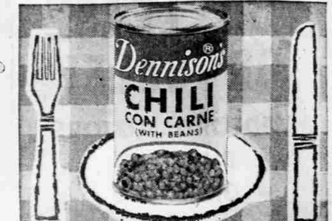
not too hot... not too bland! Slow-simmered for just-right home-kitchen flavor