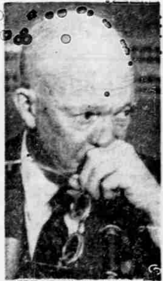
SPEAKING on world-wide radio network, President Eisenhower pledges U. S. support to Middle East nations threatened by Communism.