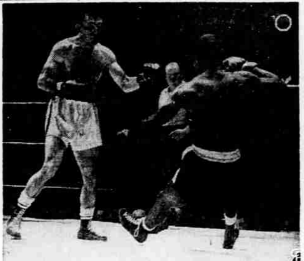
FALLING LIKE A STRICKEN TREE Johnny Saxton, former welter champ, goes down under a thundering attack by Champion Carmen Basilio, in second round at Cleveland. Knockout punch, a left hook.