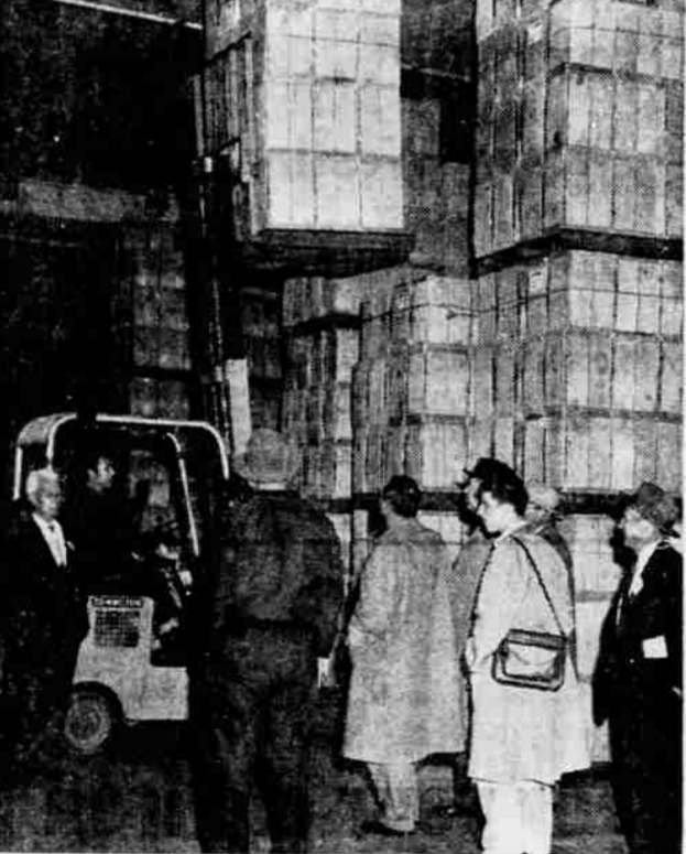
NEW SHIPPING METHOD —The use of "no end" handling of fruit boxes was demonstrated to groups of northwest pear shippers when they went on tours of local packing plants during the perishable loss prevention short course in Medford Wednesday and Thursday. The method is new, and provides more protection against bruising. Above, a Bear Creek Orchards lifted truck operator shows how 48 boxes of packed fruit can be handled at a time with the use of a pallet.