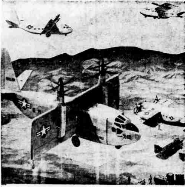
UP AND AWAY —The U. S. Air Force awarded a contract to Hiller Helicopters of Palo Alto, Calif. to develop this tilt-wing aircraft. The plane will be propeller driven and capable of vertical takeoff and landing. Designated the X-18, it will have less hovering capability but greater forward speed than a 'copter. Project will be directed by the Air Research and Development Command of USAF. Artist's conception shows the transport-size plane in a vertical takeoff. In upper left the wings are moving from vertical to forward flight. In upper right the wings are in position for normal flight.