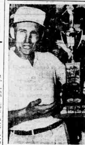
PERMANENT POSSESSION —St. Louis Cardinals' shortstop Alvin Dark proudly displays trophy after winning Baseball Players Golf Tournament at Miami, Fla. Dark retains permanent possession of the trophy by virtue of his third victory in the competition.

FINEST BOTTLING of one of America's great whiskies