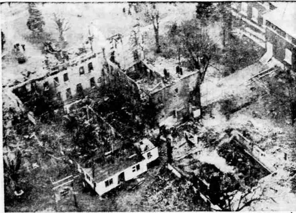
71 DIE IN HOLOCAUST—Fire-blackened walls are all that remain of the Katie Jane Memorial Home for the aged in Warrenton, Mo., after an explosion and fire mushroomed through the building killing 71 persons. Authorities said more than 225 persons, including patients and visitors, were in the building when the fire started.