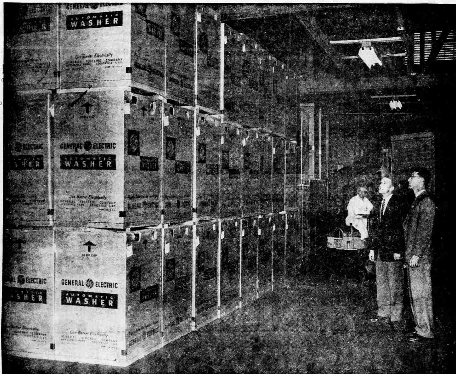
G-E Appliances in Davis Transfer Warehouse in Medford

it appeared certain to us, that General Electric's major appliance factory in Louisville, Ky., was going on strike.