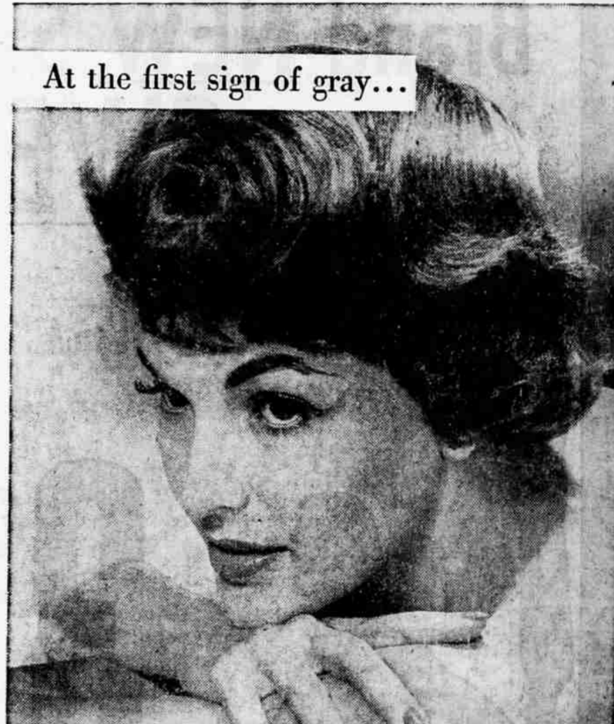
Do it at home yourself—and no one will know you've done it!

It's new! Gives your hair youthful, truthful color that won't wash out!