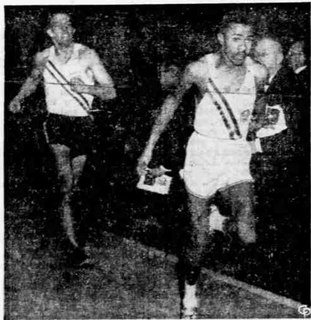
CROSSING FINISH LINE in one minute 50.3 seconds, Arnie Sowell (right), Pittsburgh, Pa., sets new world record in 800-meter race at New York. Behind him is Tom Courtney, ex-800 meter king.

Circulation of petitions on the matter, to have started last week, has been delayed.