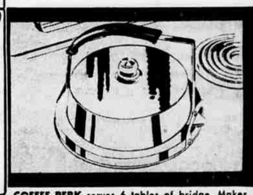
COFFEE-PERK serves 6 tables of bridge. Makes 1 1/2 gals. delicious coffee in just 25 minutes!

Exclusive new Roast-Right thermometer plays the tune "Tenderly" when your roast is done exactly to your taste!