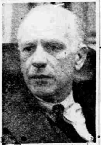
ASSUMING new post as defense mobilizer, Gordon Gray tells newsmen he sees no hope for early end of big world issues.

MORE BODIES SOUGHT Hong Kong — (UPI) — Rescue workers today found eight more bodies buried in the rubble of a tenement leveled by fire Wednesday. It brought the death total to 39.