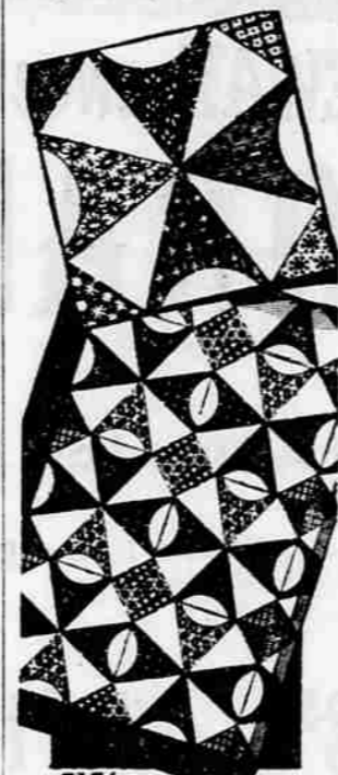
7174 by Alice Brooks

Thrifty use for scraps! Turn those odds and ends of fabric into this gay patchwork quilt. Easy to make, easy to piece—works up so quickly in 10-inch blocks!