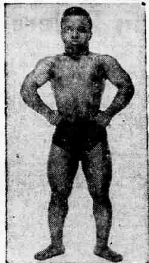
BROWN PANTHER Midget at GP Friday