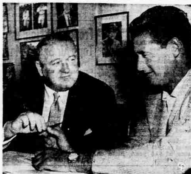
ACCEPTING PEN from Joe Cronin, Ted Williams, baseball's highest paid star, signs 1957 contract with Boston Red Sox for $100,000.

Campbell said Lindsay's remarks "represent about as fine a public relations statement as the National Hockey League could hope to have, because it is quite evident that the officials of the new association are completely satisfied with the treatment they have received from the member clubs of the NHL, both individual and collectively."