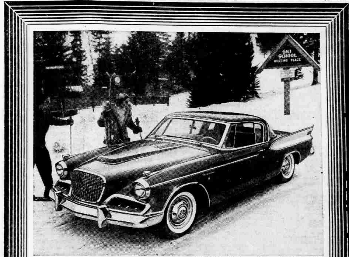
The Golden Hawk, one of 18 new Studebaker models