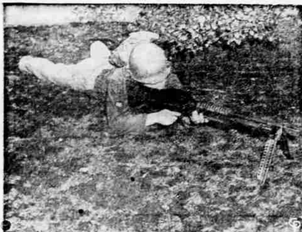
MANNING U. S. NEWEST light machine gun is a soldier trying to get the gun officials say will replace all present Army 30 caliber machine guns. It can be fired as a rifle from the hip, or from a tripod as above.