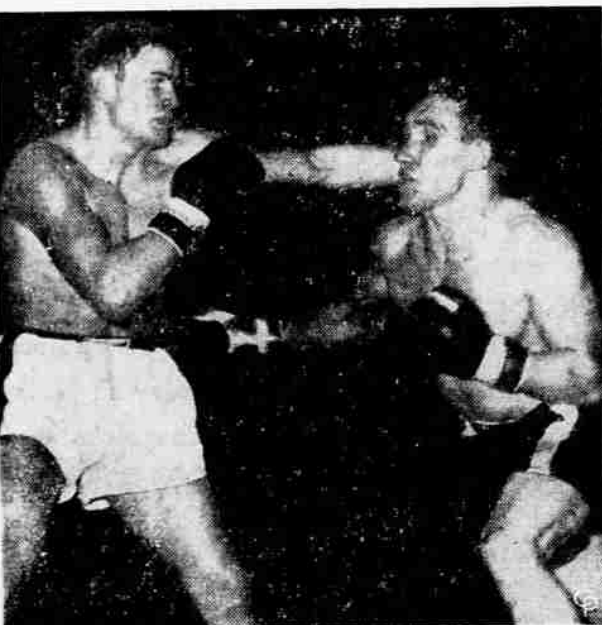
FIGHTING IN HOME STATE , Middleweight Champion Gene Fullmer (right) wins unanimous decision over Wilf Greaves, Canada, at Salt Lake City. Fullmer is sliding under straight left early in 10-round bout.