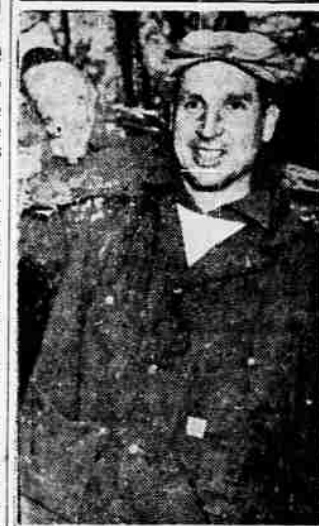
TIME OUT —Former Giant hero Bobby Thomson, whom the Giants are reportedly trying to buy back from the Milwaukee Braves, pauses with a log on his shoulder during off season work at Plainfield, N. Y. He's helping to clear lots for home that he and his father-in-law plan to build and sell.