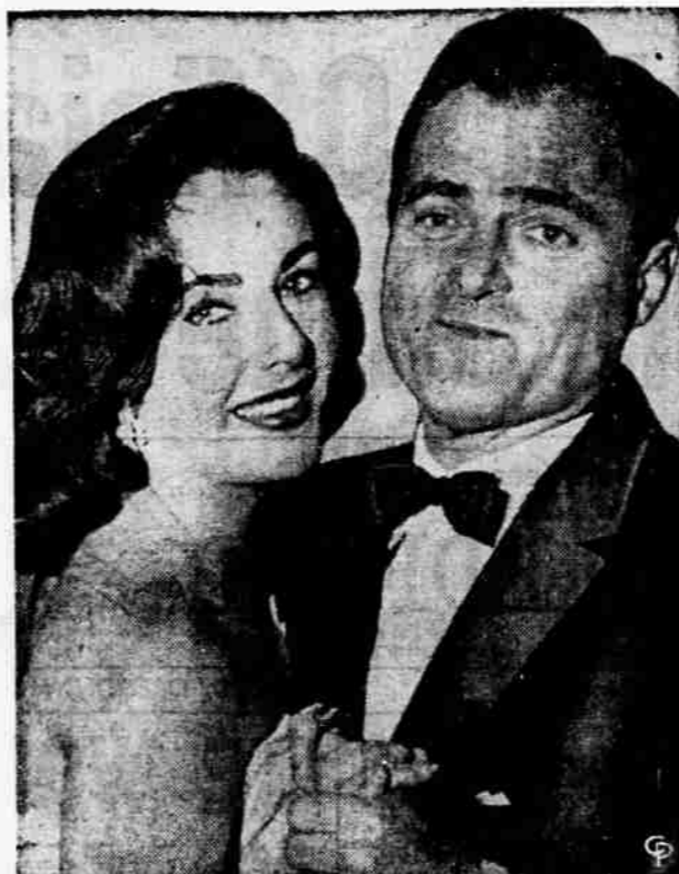
MR. AND MRS. MIKE TODD Each Vows Last Marriage