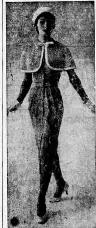
A black and white cotton tweed flyfront shawl by Jerry Parris has a detachable capelet. Narrow white round edging forms a demure bow at the neckline.

Whole wheat or bran muffins with chopped fresh California dates and walnuts in them are so delicious we sometimes have them for dessert. Serve muffins the minute they come from the oven and pass plenty of fresh butter and fragrant honey.