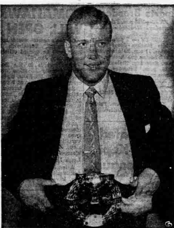
WINNING RAE HIKOK "professional athlete of year" award, Mickey Mantle, switch slugger of New York Yankees proudly shows off $10,000 diamond-studded belt presented him at Rochester, N. Y. dinner.

"Sure Machen's young, but so was Floyd Patterson when Joey beat him," said Joey's manager, Jack (Doc) Kearns. Maxim defeated Patterson, who recently won the heavy-weight crown, in June of 1934, on a disputed decision.