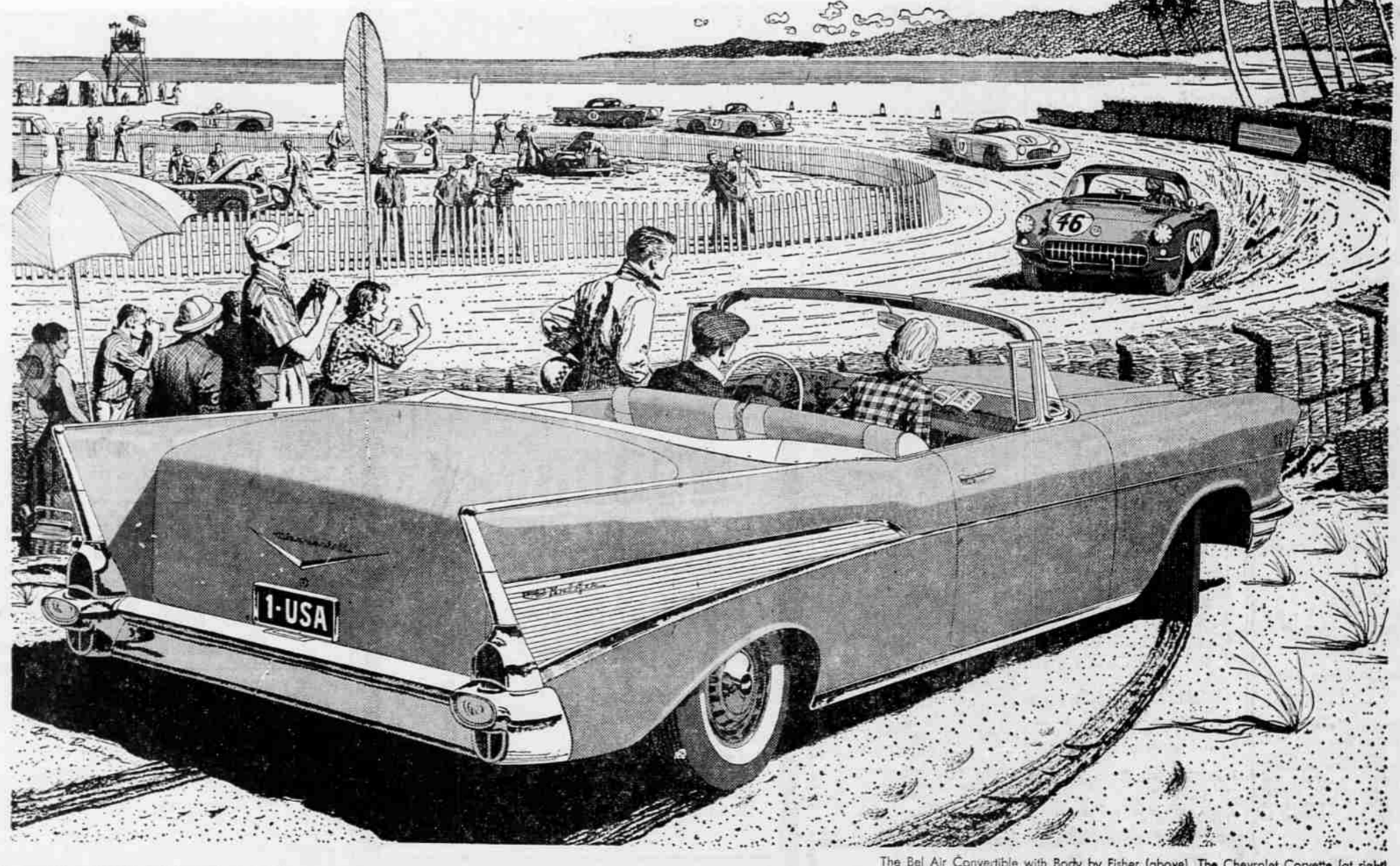
The Bel Air Convertible with Body by Fisher (above). The Chevrolet Corvette (at right).

Only franchised Chevrolet dealers display this famous trademark