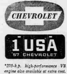
*270-h.p. high-performance V8 engine also available at extra cost.

But a Chevy isn't just something that's nice to look at. Far from it. This beauty was meant for driving! You'll see what we mean when you sample Chevrolet's cat-quick reflexes and solid way of going. Horsepower options, you know, range up to 245*. Come on in and drive the sweetest handling car you ever had your hands on. We've got the key and the car ready and waiting for you.