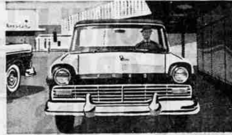
HANDLES LIKE A CAR! Ball-joint front suspension and outboard-mounted rear springs—first time on any pickup—give true passenger-car ride. Cab interior is exactly like that of the '57 Ford Ranch Wagon. Power steering, power brakes, power seat and power windows available at extra cost!

Looking at the boldly modern styling of the new Ford Ranchero, you may find it hard to believe that it's actually a man-sized truck, built to do a man-sized job. But it won't take you long to find there's a lot of left behind the Ranchero's glamour.