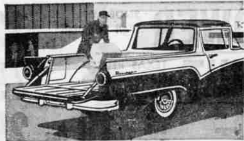
HAULS LIKE A TRUCK! No need to hold back on load. Pile it on—the Ranchero packs a greater payload than many standard pickups! Power plenty, too—Short Stroke 144-hp Six or either of two Short Stroke V-8's, up to 212 hp. Fordomatic or Overdrive available at extra cost.