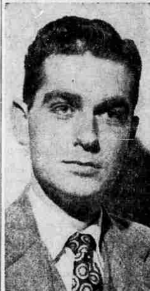
BANQUET SPEAKER —Mark Hatfield, secretary of state, will speak at the Medford Junior Chamber of Commerce distinguished service award banquet Friday at the Rogue Valley Country club. The distinguished service award will be presented to one of six finalists selected. The award is presented to the man between 21 and 35 years of age who has been outstanding in community leadership and service. See story on page 10.