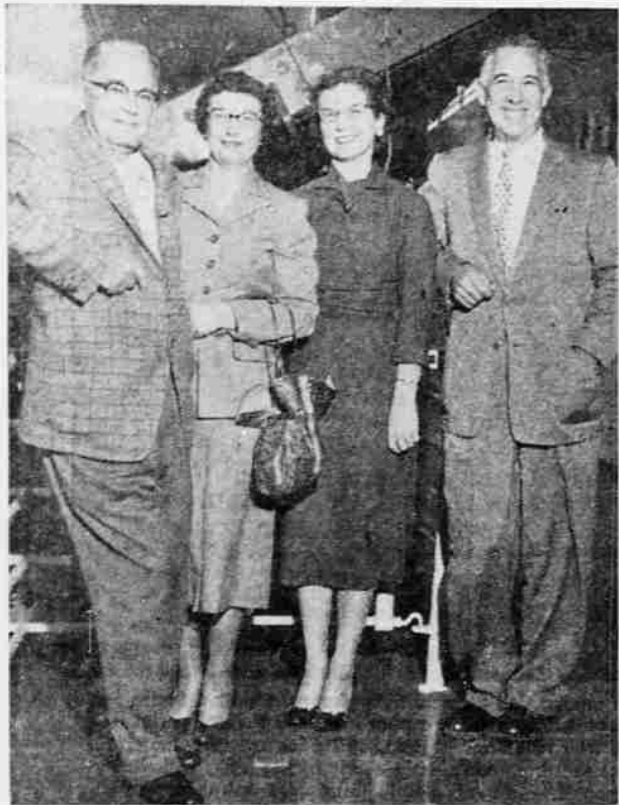
When the Mason Liner SS Monterey sailed from San Francisco recently these eight passengers from Medford were on board. The Monterey will cruise through the South Sea islands, stopping at several ports and continue on to New Zealand and to Australia. However, the Medford group will disembark in New Zealand and tour that island, re-embarking when the ship returns. Shown