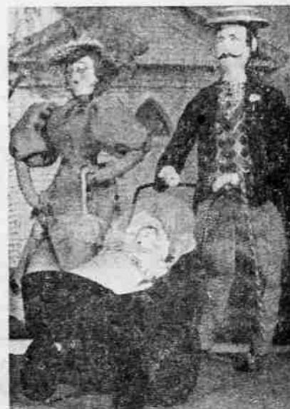
On Easter Sunday