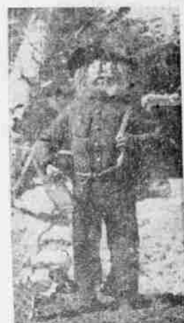
Hermit of the Rogue