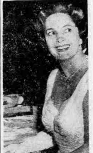
WEARING a million dollars worth of diamonds, including a 52-carat ring, is the wife of Begum Aga Khan, at the Imperial Ball in New York City.