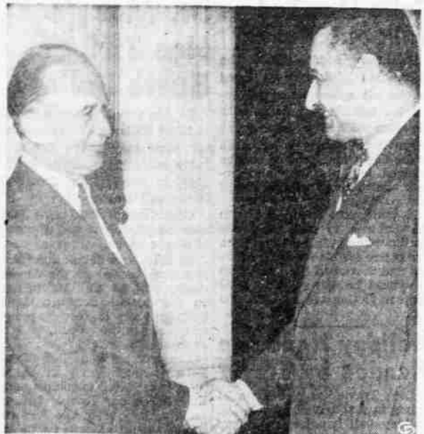
MAKING FORMAL CALL on Egyptian President Nasser before departing for Washington, U. S. Ambassador Raymond Hare (left), is given warm welcome. They discussed "Eisenhower doctrine for Mid-East" which President Nasser later openly criticized.