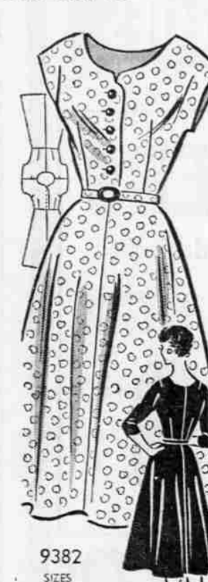
9382 SIZES 14½-24½