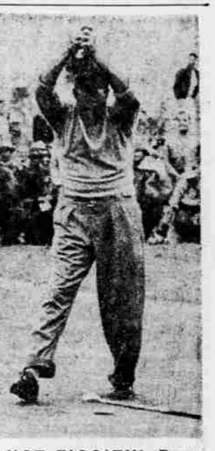
HOT ZIGGITY! —Doug Ford of Mahopac, N. Y., dances a jig on the 18th green after sinking final putt for a 280 and winning the Los Angeles Open tournament. His first place money netted him $7000.