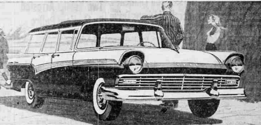
The 6-passenger Country Sedan