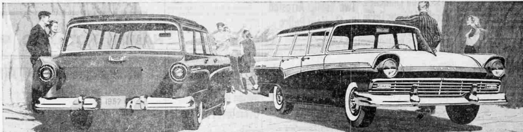
The 6-passenger Country Sedan