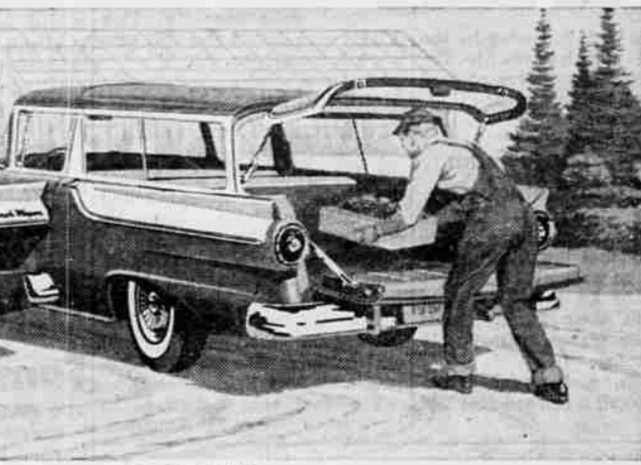
The Ranch Wagon