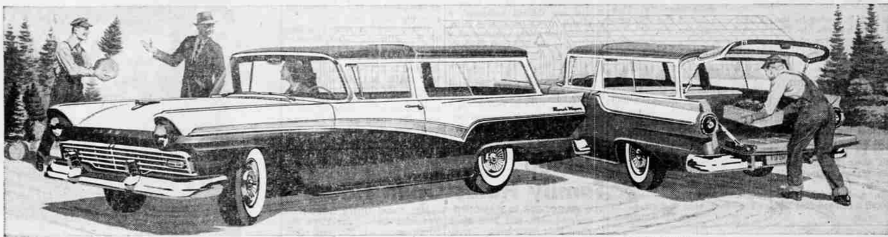
The Del Rio Ranch Wagon